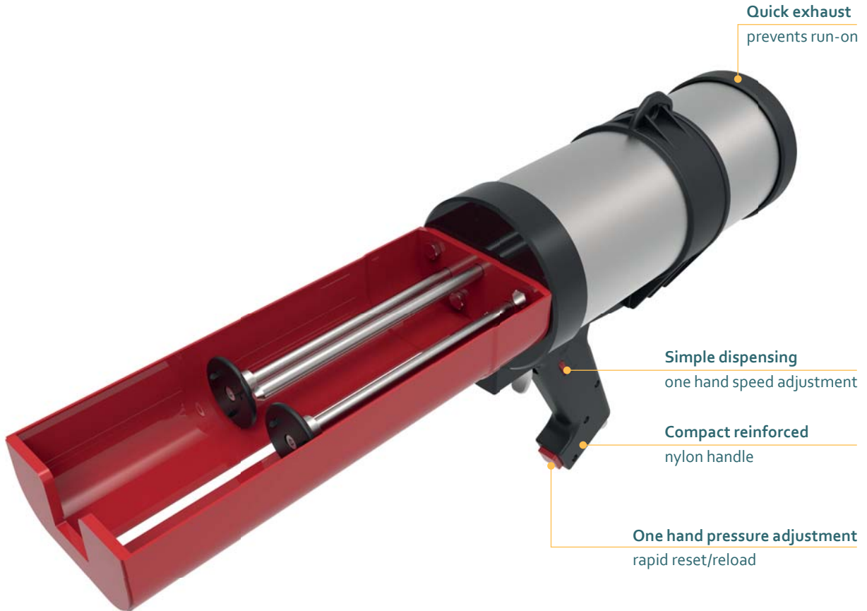
Model shown: TS447 X-625 580 mL