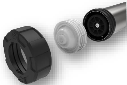
Quick Change Plunger allowing you to quickly go from sachet to cartridge

Where the H4o+ Combi is different is its larger more versatile barrel-design that's capable of taking sachets or cartridges.