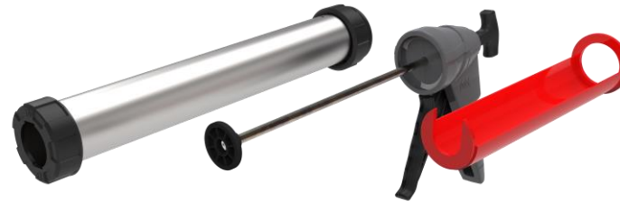
Versatile The Combi version can be used with a wide range of materials including cartridges and sachets (up to 600 mL)